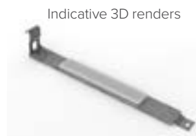
Indicative 3D renders

Suitable for wall applications that require less than 5% coreflute cushioning tape.