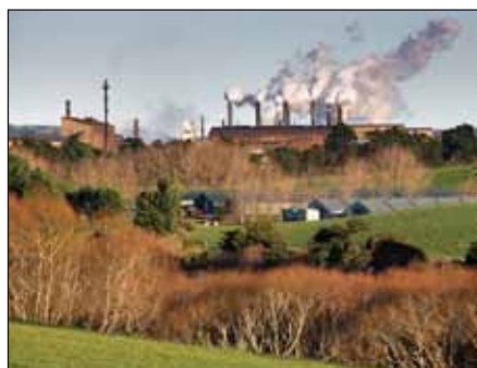
New Zealand Steel has invested considerable capital in its environmental management systems, in particular emission control, at the Glenbrook site.