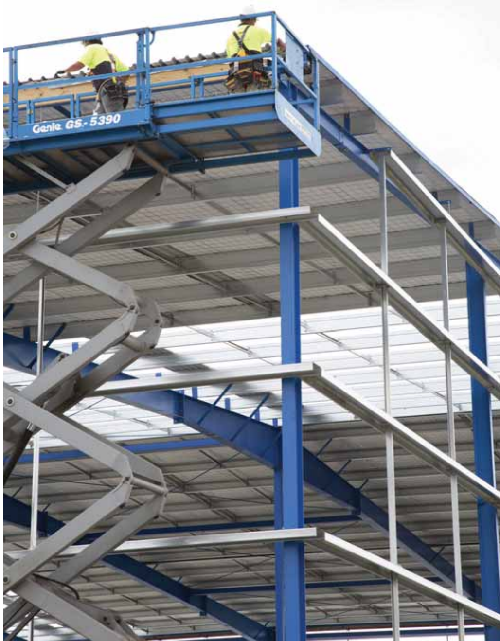
Construction of a steel-framed barn.

One such policy commitment is NZS's zero waste vision. Steel generates minimal production,