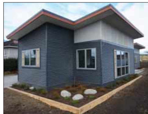
Beacon Pathway's NOW Home in Rotorua. New Zealand Steel is a shareholder of Beacon Pathway. The company also sponsored the Sustainable Build '07 conference.