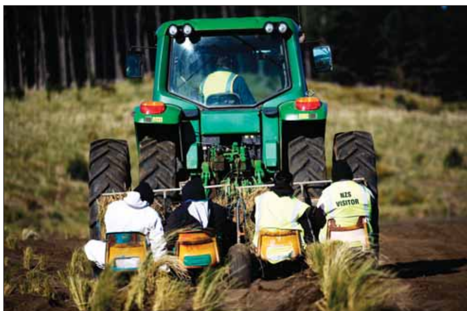
Replanting Marram grass on mined-out sand dunes at New Zealand Steel's Taharoa mine site, part of the rehabilitation programme. New Zealand Steel is unique among world steel producers in its use of local ironsand to make iron and steel. After extracting the titan-magnetite concentrate, unwanted material is returned to the areas that have been mined, to begin the process of returning the land to its original form.