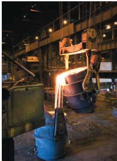
The New Zealand Green Building Council's Green Star NZ rating tool requires steel to have a 60% recycled content to gain points, but due to its durability, steel demand is far greater than the availability of scrap steel.